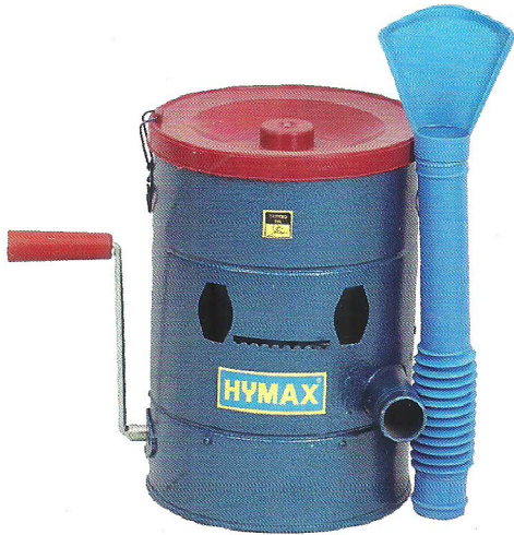
Model: HX-502 / AL Box Size: 12" x 11" x 14.6"