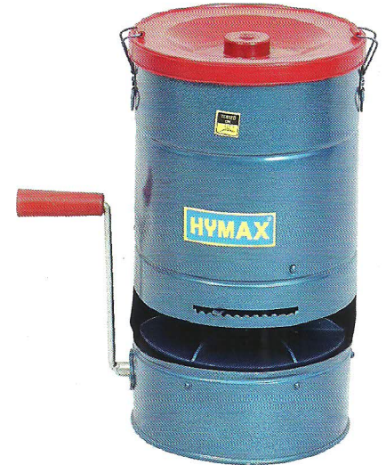
Model: HX- 503 / AL Box Size: 11" x 11" x 18"