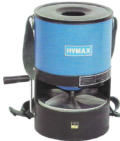
Model: HX- 503 / PL Box Size: 12" x 12" x 18.4"